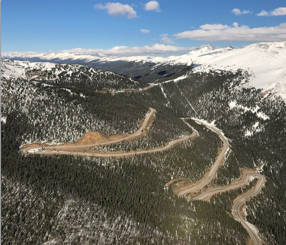
Rare shot of Berthoud Pass taken from a flyover mid October.